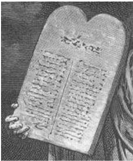
The Ten Commandments